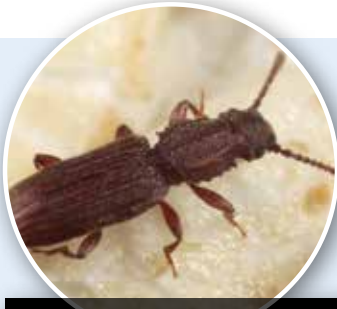
SAW-TOOTHED GRAIN BEETLE ( ORYZAEPHILUS SURINAMENSIS )