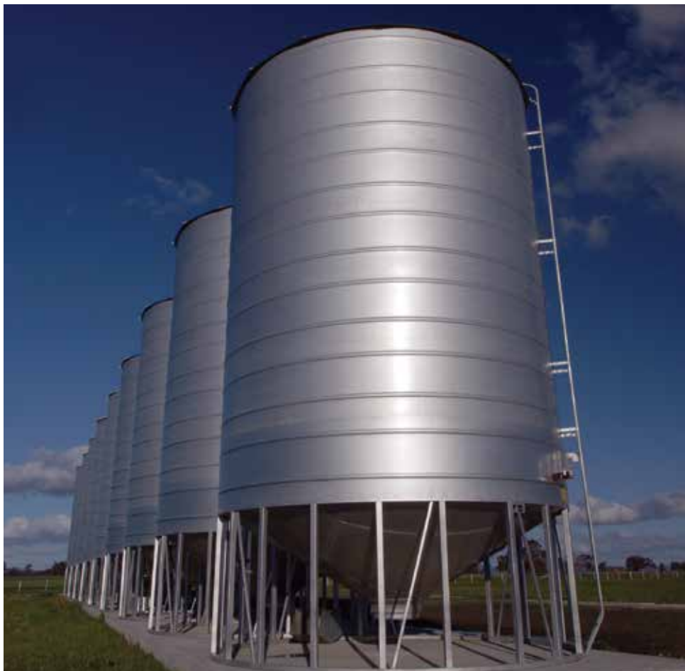
Keep it safe in silos: Storing pulses in silos that can be aerated or gas-tight sealed allows for quality and pest control not available to other storages.