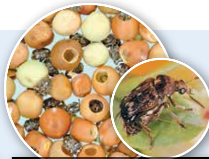
PEA WEEVIL ( BRUCHIDS PISORUM )