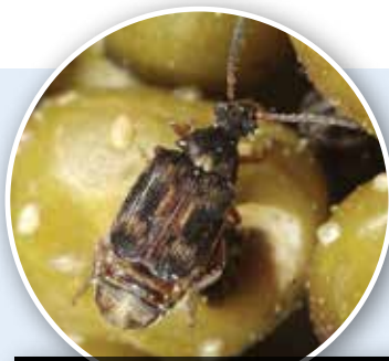
COWPEA WEEVIL ( CALLOSOBRUCHUS SPP.)

Weevil development ceases at temperatures below 20°C. This is a strong incentive for aeration cooling, especially if gas-tight storage is not available.