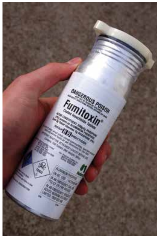
Limited options: Fumigants such as phosphine or a controlled atmosphere are the only option to kill pests in stored pulses. All of which require a gas-tight, sealable storage.